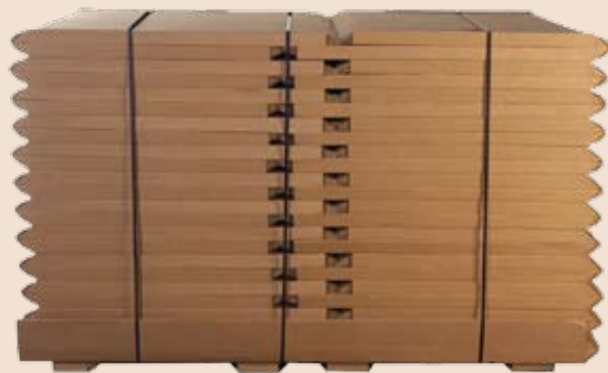
SpaceKraft containers arrive flat and save up to 80 percent of trailer and warehouse space required for some rigid IBCs or drums.

For more than 20 years, SpaceKraft has delivered proven results to thousands of customers in the food and industrial chemical industries. Millions of successful containers shipped prove the success of the SpaceKraft product.