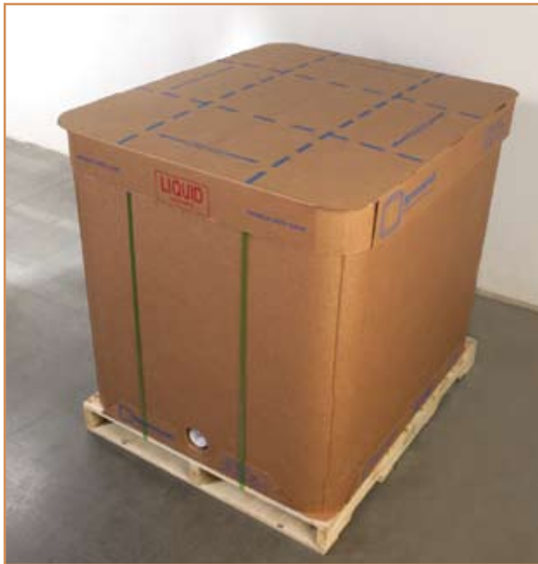
One ReadyFill can do the job of up to six drums. ReadyFill arrives pre-banded, ready-to-fill, complete with the new liner and requires no labor for set-up.

In addition, no venting is required when emptying.