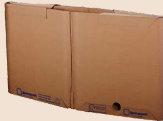
SpaceKraft's outer sleeve, constructed from multiple layers of wound corrugated, provides the top-to-bottom and side wall strength that makes the SpaceKraft tote unique.