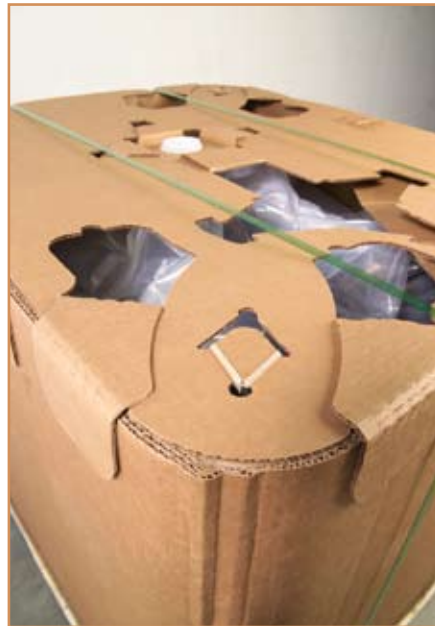
ReadyFill arrives complete with the form-fit liner installed. To fill, remove the protective lid and tamper evident seal to access the screw cap.