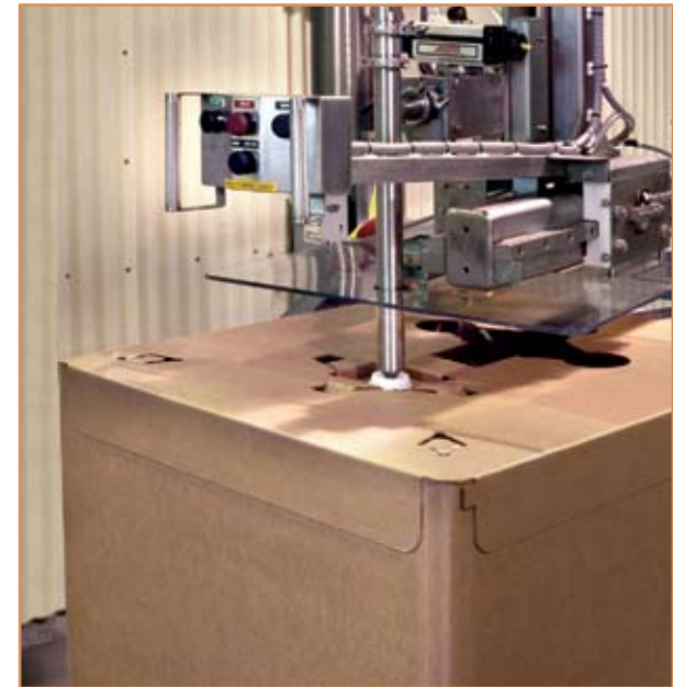
ReadyFill is compatible with automated filling equipment that is often used with standard drums and totes.