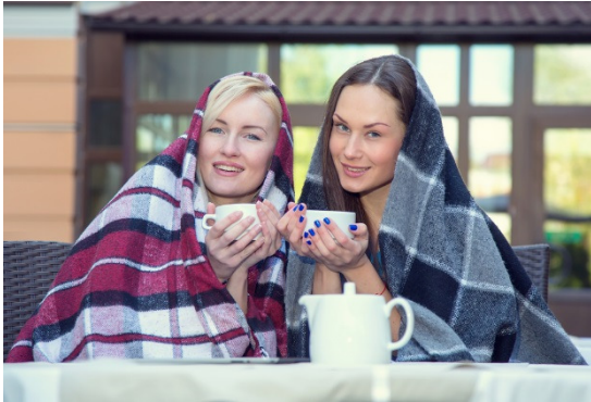
It can get quite chilly at dusk, even in summer

Most house designs feature an outdoor area for entertaining families and friends. However, in our temperate climate, the temperature can suddenly drop at dusk or during a cool change ... 6 - 10 °C in just two hours. Handing out blankets to your guests is not an ideal option, so to maintain comfort outdoors, many people rely on gas patio heaters.