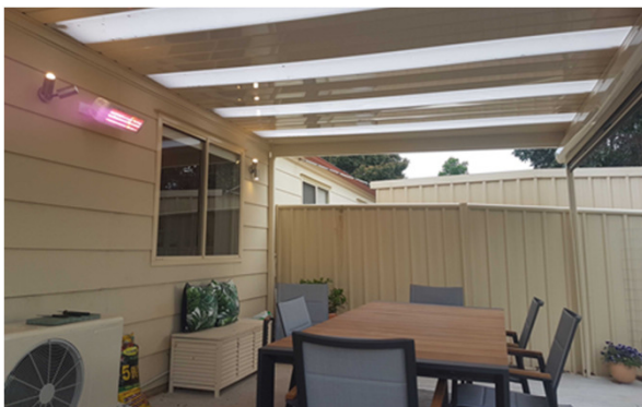
Halogen infrared is the most efficient method of providing comfort heating outdoors

Each lamp consumes 2000 watts. With current power prices, this means around $0.70 per hour, significantly less than the $1.80 per hour for a 9 kg gas bottle. And being electric, they can be wired into sensors to operate only when people are outside.