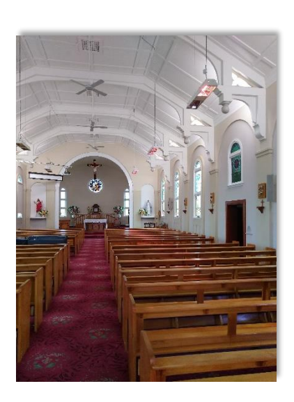
AFTER: ST. JOSEPHS PARISH FITTED WITH HELIOS TITAN EHT2-40 SHORT-WAVE INFRARED HEATERS

Interested and require more information? Please contact your local representative or email us at info@sbhsolutions.com.au