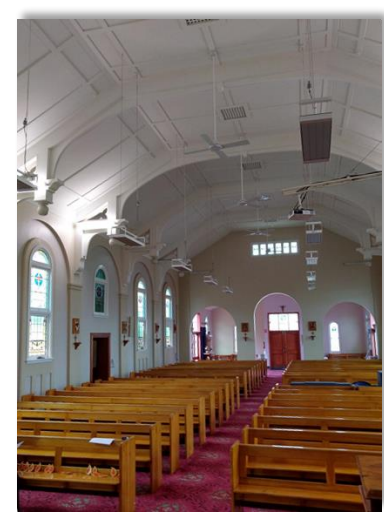
BEFORE: ST. JOSEPHS PARISH WITH LONG-WAVE IR PANEL HEATERS

Each unit comprising of 2 x 2000W of Short-Wave Infrared heating installed at a height of 3.5 metres provide a heat range of up to 32M<sup>2</sup>.